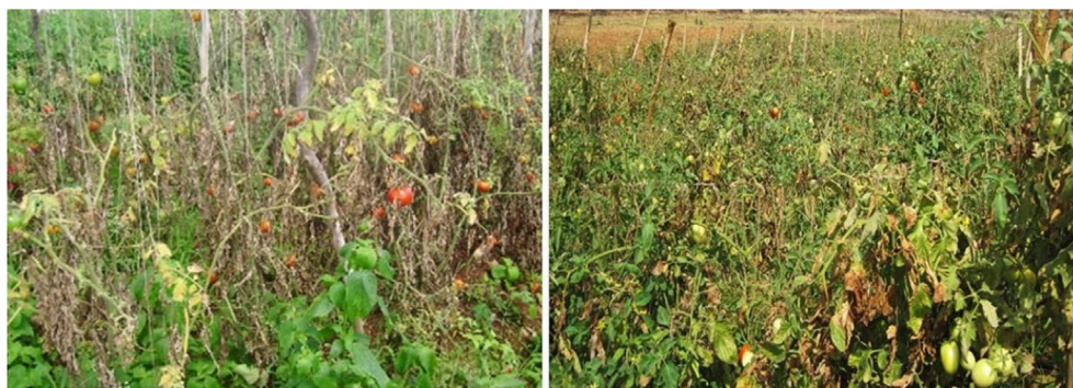
Fig. 1. Fusarium wilt caused by F. oxysporum f. sp. lycopersici in field conditions.

As a characteristic of soil-borne pathogen, FOL can survive extensively in soil as dormant propagules (chlamydospores). Host root presence triggers the germination of chlamydospores. The