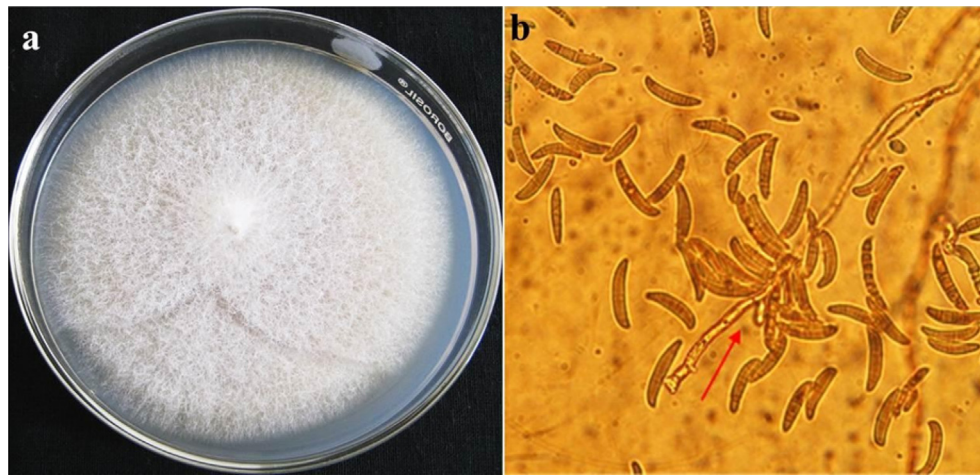
Fig. 2. (a and b). Cultural and morphological features of Fusarium oxysporum f. sp. lycopersici . (a). F. oxysporum colony of Fusarium sp. on PDA agar; (b). Microscopic view of macroconidia of F. oxysporum f. sp. lycopersici , macroconidia abundant, commonly three septate and the attachment of the macroconidia to the mycelium is observed.

infection hyphae adhere to and then penetrate the root surface. The mycelium invades the root cortical cells intercellularly and enters vascular system through the xylem pits. Subsequently, the fungus displays a unique pathway of infection where it tends to colonize exclusively inside the vessels of xylem, further rapidly colonize the host. Within the vessels, the fungus starts to produce microconidia, which are transported to upwards through sap stream upon detachment. Further, germination of microconidia leads to mycelial penetration of the upper vessels. The characteristic wilt symptoms appear due to vessel blockage triggered by the gathering of fungal hyphae and a combination of host-pathogen interaction such as, the release of toxins, gums, gels, and formation of tyloses. Typical disease indications, such as leaf epinasty, vein clearing, wilting and defoliation, appear and eventually precedes host plant death (Figs. 1 and 2). During this phase the vascular wilt fungus, which stays limited to the xylem vessels, propagates through parenchymatous tissue and begins to sporulate abundantly on surface of the plant such as, leaf, stem etc. Dissemination of the pathogen can occur via seeds, transplants, soil or other means (McGovern, 2015; Renu Joshi, 2018).