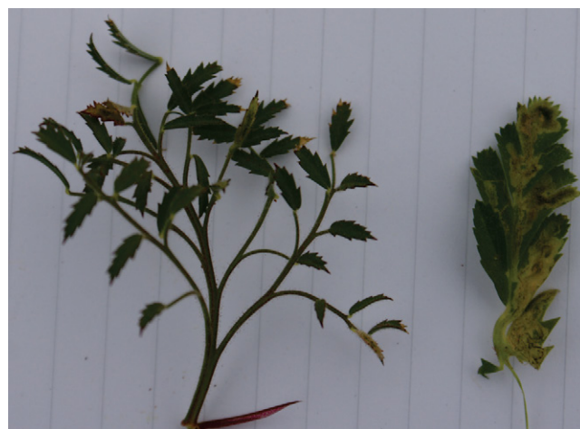
Fig. 2. Leaf miner damage on simple leaf of Sierra chickpea (right) and no leaf miner damage on multipinnate leaf of AWC 612M chickpea (left).

For leaf miner damage observations, all 14 accessions were repeatedly grown at Antalya, Turkey, for 10 yr from 2007 to 2016 under rainfed conditions. Trials were fertilized each year with 20 kg ha -1 N-P-K (20-20-20) before planting. All the accessions were sown by hand into 2-m-long rows using a row spacing of 50 cm and plant-to-plant spacing of 10 cm within a row. ILC 3397 and YAR germplasm were grown every 10 or 20 rows as a susceptible control. At the screening nurseries, the experiments were arranged as a randomized complete block design with two replications each year, with the exception of six replications in 2012.