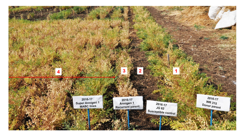
Fig. 3 Evaluation of Super Annigeri lines with Annigeri 1 (recurrent parent), JG 62 (susceptible check) and WR 315 (donor parent) in wilt sick plot at ARS, Kalaburagi during 2016–2017. WR 315, the donor for FW (see row numbered 1); JG 62, the susceptible

Earlier studies revealed that resistance to FW is either monogenic or oligogenic based on the race and the cultivars used in the study. However, resistance to race 4 was reported as recessive and digenic in nature (Tullu et al. 1999). Several studies involving inter- and intraspecific RIL populations revealed the organisation of resistance genes for fusarium