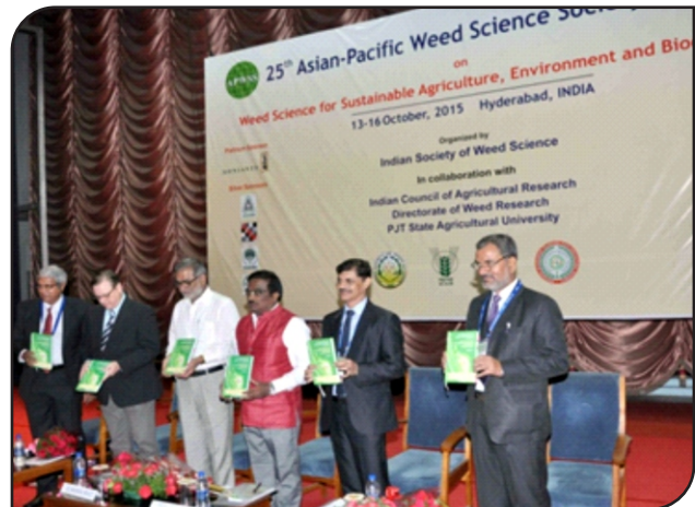
Photo: 3. Release of the book edited by Drs. A.N. Rao and N.T. Yaduraju at 25th APWSS Conference, Hyderabad, 2015.