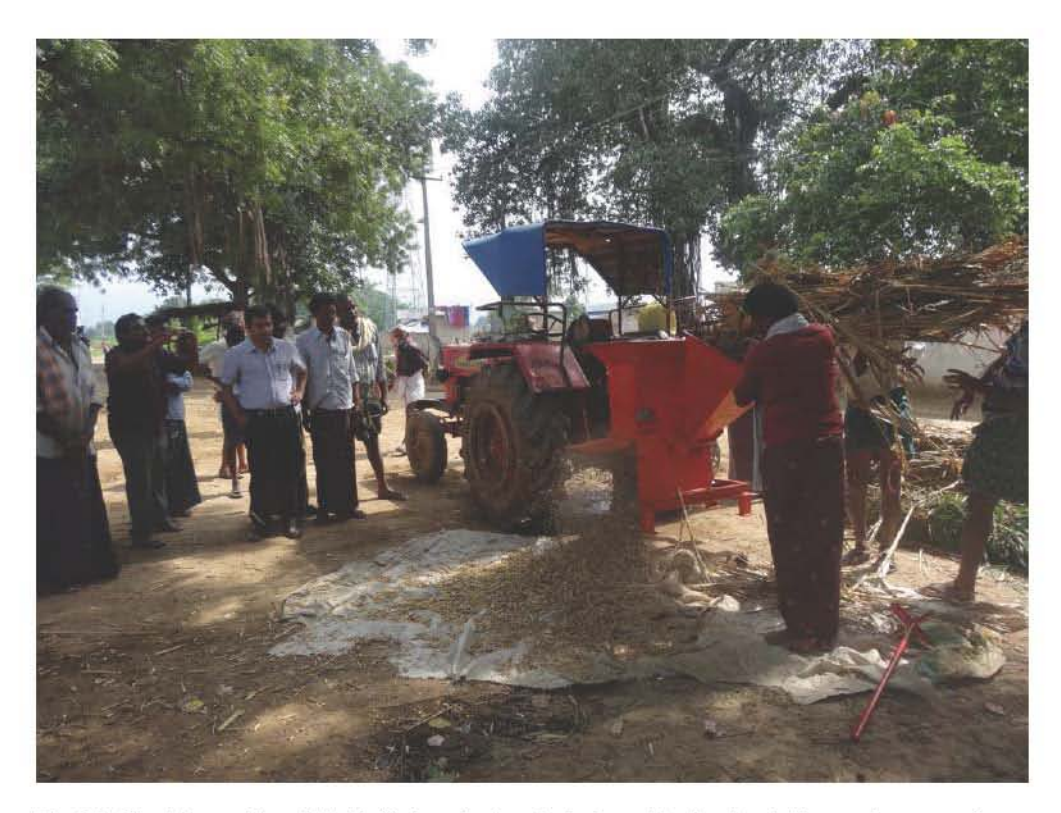
Fig. 3.2. Shredder machine piloted in Kadapa, Andhra Pradesh used to chop hardy biomass for composting.

model for chopping biomass for composting which prove to be economically remunerative from the first year. Alongside, composting technologies need to be scaled-out to farmers. Vermicomposting is a proven technology, but in many case desired success is not achieved due to the need for continuously maintaining moisture and arranging feeding material to earthworms. So, technologies like use of microbial consortium culture for composting needs to be promoted for undertaking it as and when needed and adding convenience to the farmers. Along with mapping for potential recyclable biomass in agriculture and horticulture, regions with current low chemical fertilizer use could also be prioritized and promoted as niche areas for organic farming without compromising with yield and harnessing premium price for the farmers. Also converting biomass into Biochar, having highly stable form of C, may be a good option of building soil C for long term (Sohi et al., 2009); however, the long-term effects need to be evaluated.