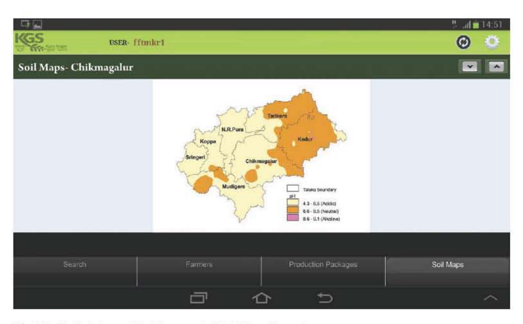
Fig. 3.4. District-wise soil fertility maps in Krishi Gyan Sagar App.