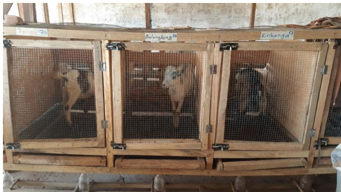
Figure 2: Goats in metabolic cages during trials