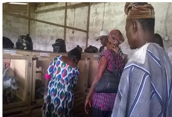
Figure 3: Farmers on visit during trials