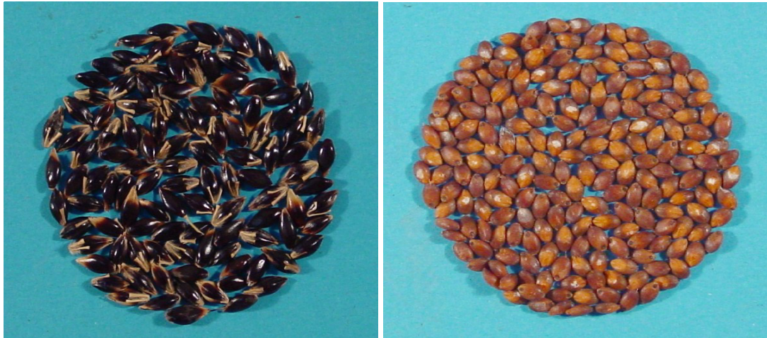
Figure 1. Sorghum seed with glumes (left) and glumes removed (right).

while it increased to 97% and 72%, respectively, when glumes were removed and tested for 20 days. Both these accessions had zero germination when fresh seeds (with glumes) were tested. On the other hand, there was a significant improvement in germination for seeds of S. arundinaceum (IS 21368) when tested with glumes (0–55%) and glumes removed (0–100%) and test duration extended to 40 days.