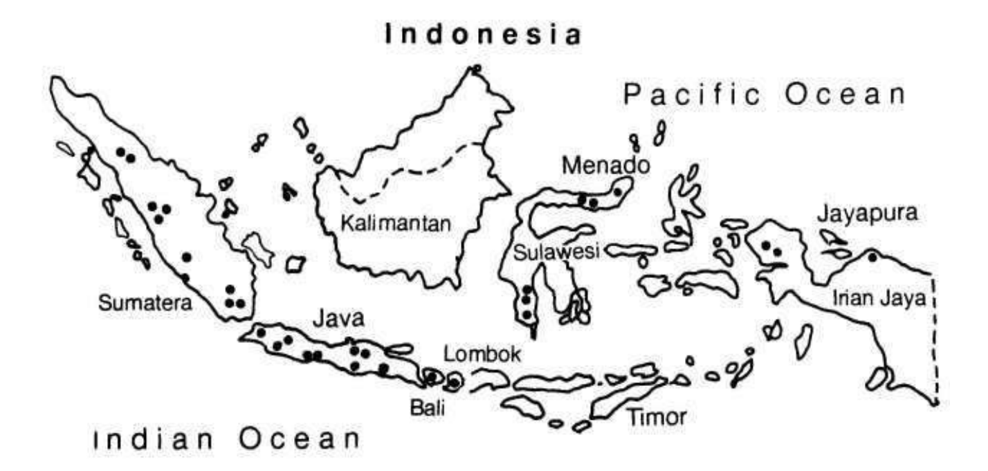
Figure 1. Distribution of groundnut bacterial wilt in Indonesia (• indicates the presence of bacterial wilt).

In the past, most of Indonesia's groundnut crop was grown in Java. At present about twothirds (approximately 400 000 ha) of the groundnut area is still in Java, but the crop is also grown on other islands, such as Sumatera, Bali, West Nusa Tenggara, Sulawesi, and Irian Jaya. Annual surveys carried out since the 1984/85 wet season indicate that bacterial wilt is still widespread in Indonesia (Fig. 1). High disease incidence was common in West Sumatera, Lampung, West Java, parts of Central and East Java, and South and North Sulawesi. Lower incidence was found in North Sumatera, Bali, Lombok, and Irian Jaya. Wilt intensity varied with season, locality, and cultivar. Disease intensity generally ranged